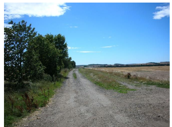
From the road junction the track heads south east to Ashwell Street

5 This time at the junction pick up the track on your left, heading south east. I don't know if it is just me, but there always seems to be more wildlife here than in other areas of open farmland: kites, larks, rabbits, hares and so on. I won't mention the rats.