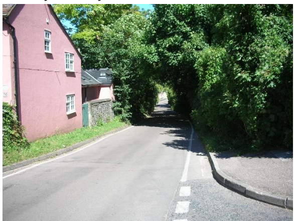
Turn right into Kingsland Way and down the hill

6 Cross straight over Station Road, where Ashwell Street becomes a track again and goes uphill. This section is known as 'The Ruddery'. Just before the top there is a break in the trees on the right, marked by a gate. It provides a good view of the village and the countryside beyond.