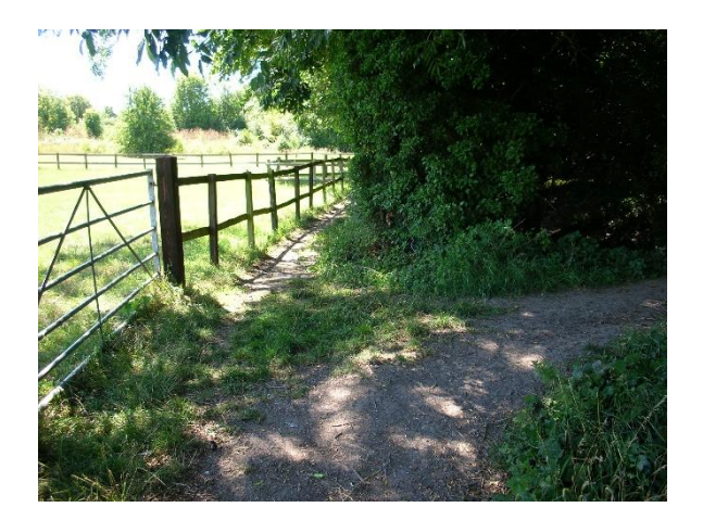
The path on the right leads through White Wood Nature Reserve

One path goes left, following the edge of the wood and another on the right takes you through White Pond Wood nature reserve. There are several paths through the reserve but it is too small to really get lost. Try and stay close to the ditch.