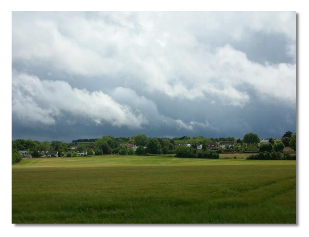
Ashwell village under cloud: looking south east from the track leading to Gardiners Lane