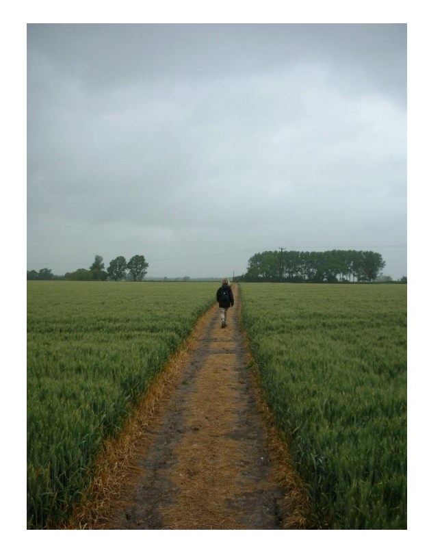
To infinity... and beyond

This track goes along the right hand side of the tree cluster and cuts across an open field to reach a road.