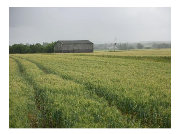
Go to the right of the solitary barn

3 At the next track junction, turn left toward a solitary barn and pass it on the right. The track widens and takes you toward two houses at the medieval moats.