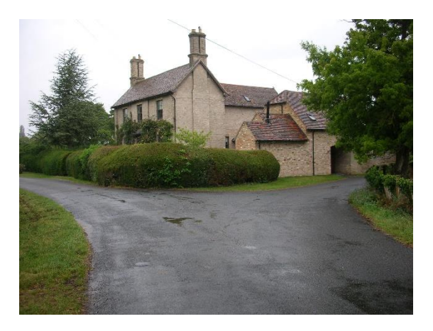
Gardiners Lane: at the T junction, turn right. Apparently our part of England is semi-arid..

Follow Gardiners Lane past the entrance to the doctors' surgery on the left, up to a large house ('The Grange'} at the T junction. Turn right.