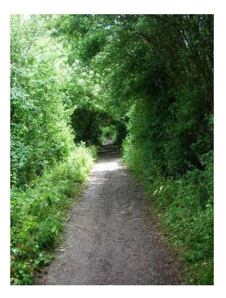
This shaded avenue makes a pleasant change from open farmland

4 Go right and continue until the road bends sharply again to the right but continue straight ahead down the track. It becomes more shaded after a short distance.