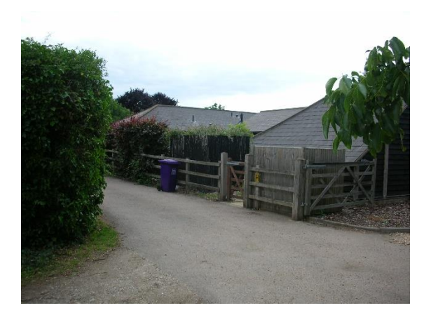
Left down the lane. (Hinxworth place will be on your left)

At the corner of the manor house plot the track reaches a junction. Go left down the lane.