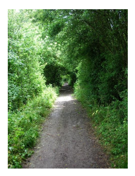
This shaded avenue makes a pleasant change from open farmland

5 Go right and continue until the road bends sharply again to the right but continue straight ahead down the track. It becomes more shaded after a short distance.