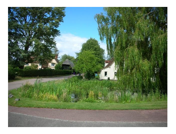
View of the duck pond in Chapel Street (taken from the drive on the extreme right hand side)

The lane passes houses until it reaches a junction with a gate and a path on the other side that descends gently across a large open field. This long, straight run crosses another junction with a farm track and large house to your right, then yet another large field.