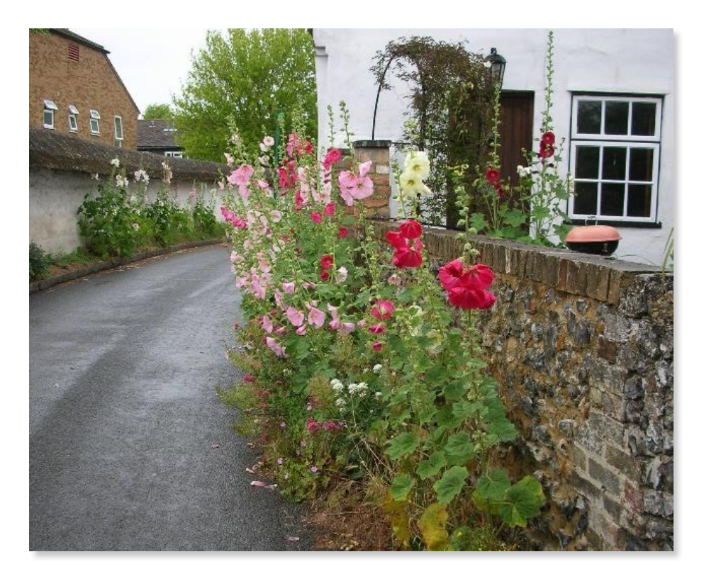
End of the walk: looking back along Gardiners Lane