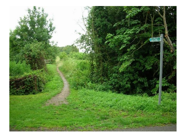
Path to Ashwell End (medieval moat on the left hand side of the path)

At the lane turn left again and look out for the finger post on the right pointing to Ashwell End.