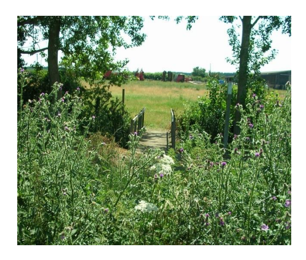
The footbridge is not easy to see

4 At the road turn left and continue until you reach the asphalted turnoff to the pig farm on your right.