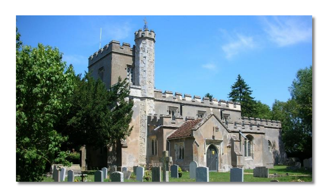
Church of St Vincent, Newnham