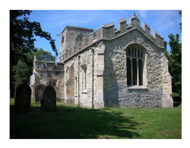
Church of St Mary Magdalene, Caldecote

2 Follow the track with the field on the left until you come to a house with a concrete roadway outside then turn right, passing some farm buildings on your right. The Church of St Mary Magdalene is on the left behind the trees, just beyond the hard standing. Constructed largely of the relatively soft local stone, clunch, it has nevertheless survived for 900 years.