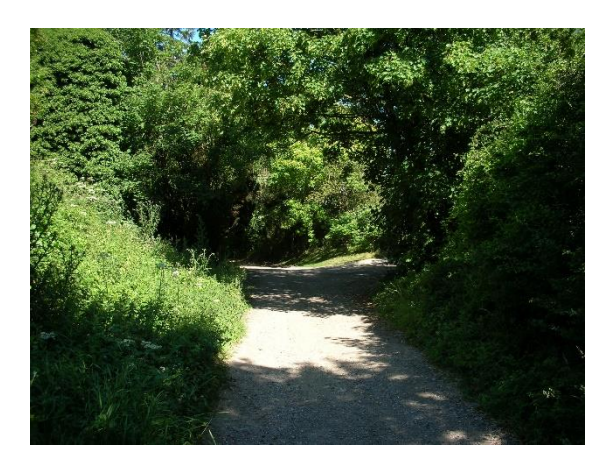
Junction, with Ashwell Street on the right

6 After 250 metres take the turn-off to the right. This is Ashwell Street; a path and road that runs the length of the village and continues further east to Bassingbourn cum Kneesworth.