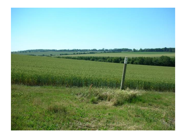
Signpost with Bygrave in the background

Go straight past the farm - where the asphalt turns into a track - and up to the 'T' junction marked by a lonely-looking wooden signpost. Turn 90 degrees left up a short climb. Afterwards the track levels off as you pass a row of hawthorn trees on your left hand side.