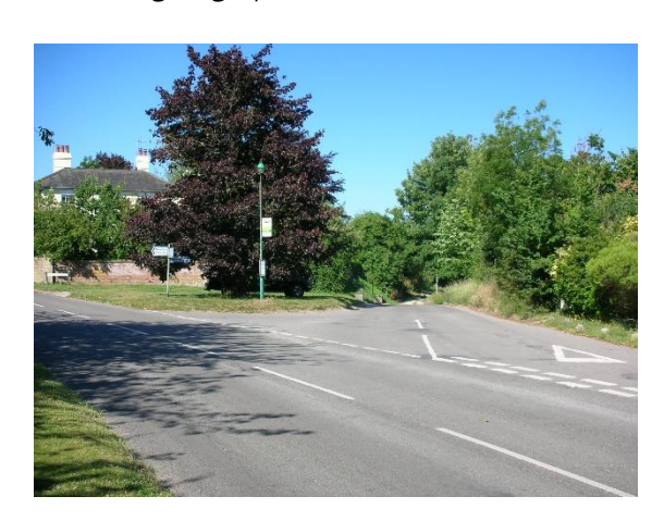
Right Fork, then take the track uphill

Turn right along the High Street and carry straight on along West End for 600 metres to a junction just outside the village. Go down the right fork, the Hinxworth Road, and take the track going up the hill.