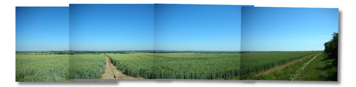
Part of the panoramic view from the top of Newnham Hill

5 The church will be in view now but the communal cottage garden on the right could be a good place to sit and take a short break.