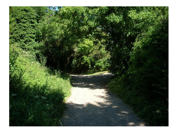
Junction, with Ashwell Street on the right

4 After 250 metres take the turn-off to the right. This is Ashwell Street; a path and road that runs the length of the village and continues further east to Bassingbourn cum Kneesworth.