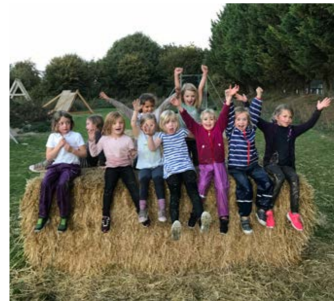
Teambuilding exercise at the Fit 4 OCR obstacle course.

In the summer we enjoyed completing the roundabout get healthy badge and the Herts 100 Walking Challenge badge. Among other things, we learnt about the Green Cross Code and the Countryside Code. We made energy balls to eat and did some circuit training, went on a sensory walk and visited Ashwell Quarry, where we learnt a lot about what can be found there.