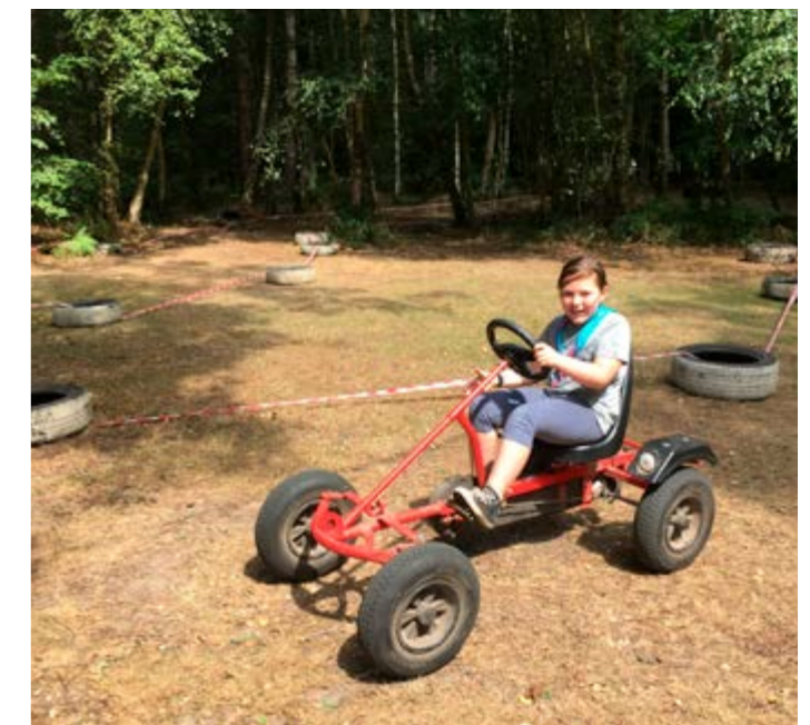
Go-cart fun at the county camp.

Brownie Leadership Team ✉ ashwellbrownies@gmail.com