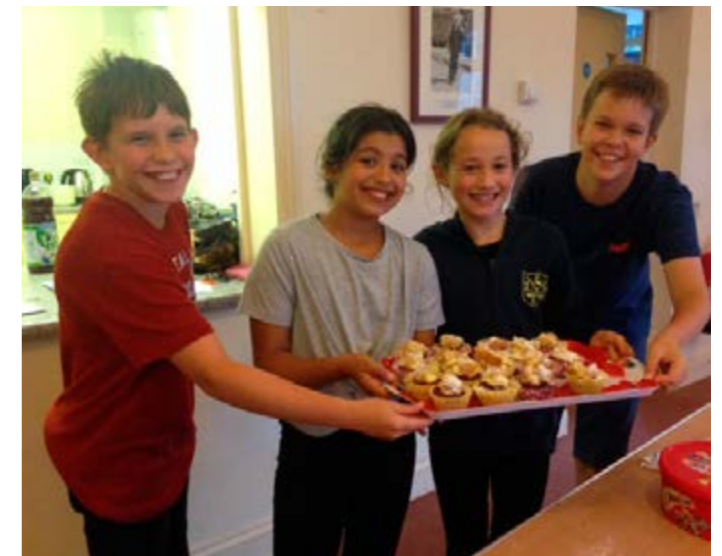
Baking cakes for Sunday afternoon teas in the Parish Room.

Asheteria provides a safe place for young people to hang out and chat to friends; participation in the games and activities is entirely optional. Our friendly youth leaders are available for them to talk to and to help make sense of any worries they may have.