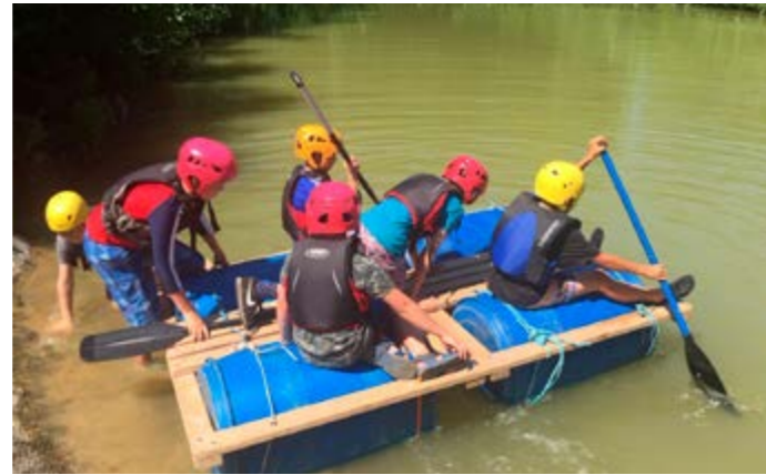
Scouts Rafting at Boyd Campsite in Henlow

We are indebted to the leaders, almost all of whom also have work and family commitments and who generously find time to support our village's young people. We always welcome new helpers to make sure we have room for as many young people as possible. It's very rewarding. There is a fantastic support network and your level of commitment could vary from once a month to weekly. If interested, please get in touch. To find more information about the Scouts, go to www.lbdscouts.org.uk