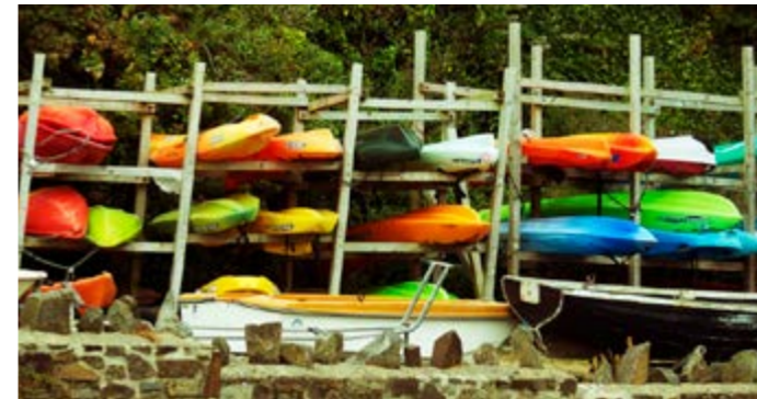
Canoes at Hertfordshire County Camp, Lees Wood.

More recently, some of the Guides did the Camper badge at this year's county camp at Lees Wood in Watford. It was a big camp, with over 600 guides attending. Activities at the camp included bushcraft, pioneering, a circus day, climbing, archery, shooting, water activities, a camp challenge and a live band on the last night, to name just a few. Some of the things the Guides had to do to earn their Camper badge were: pitch their tent, look after the equipment and their own kit, and cook for themselves — and for the leaders, of course.