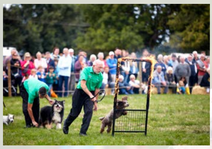
The Essex Dog Display Team.

vibe. Attendees brought their own picnics and enjoyed a whole host of musical performances. Judging by the amount of beer consumed, it was a great success! Keep a look out on www.ashvillefestival.co.uk for more information on Ashville 2019.