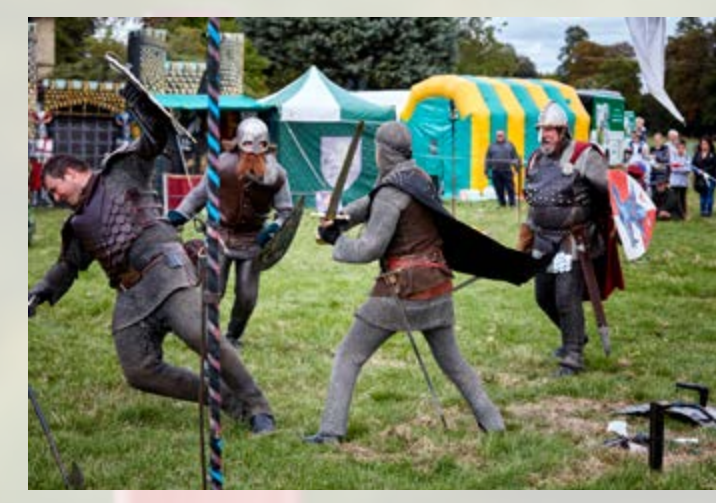
Historical Society re-enactment.