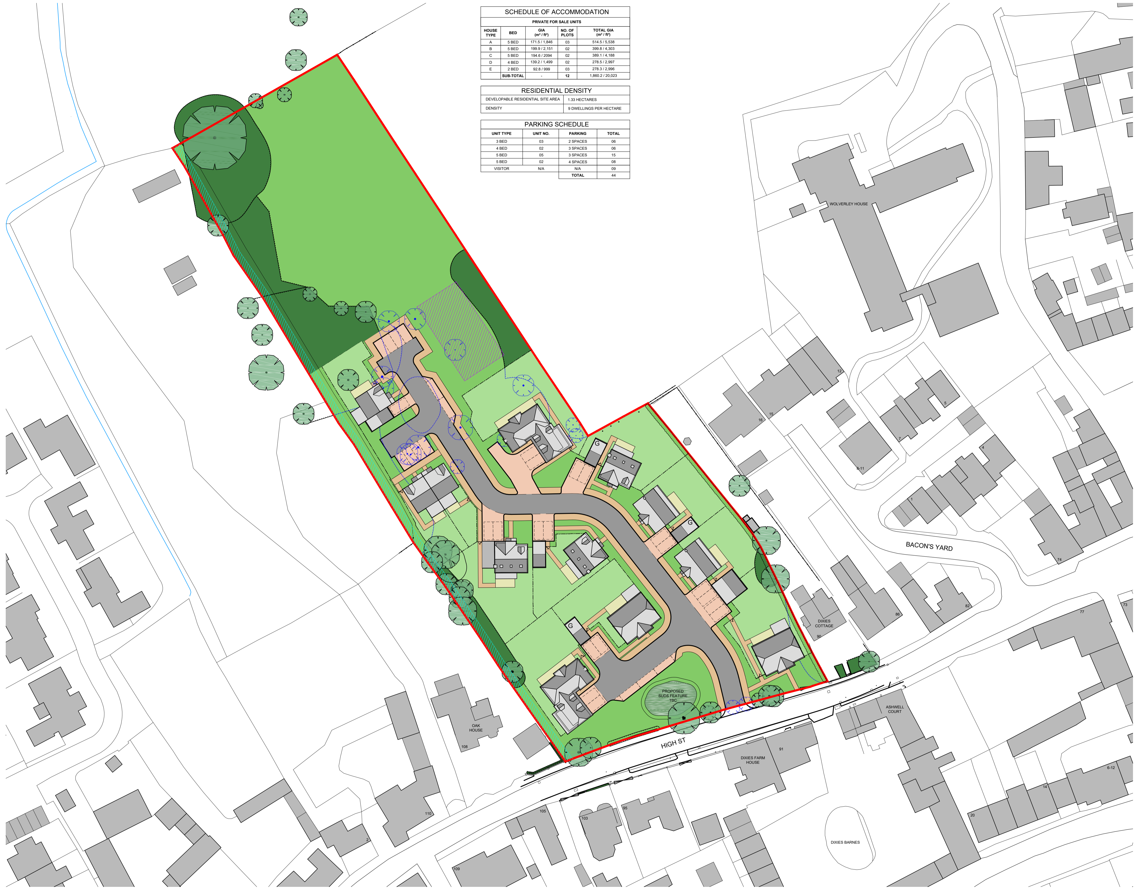
PROPOSED CONTEXTUAL SITE PLAN - COLOURED