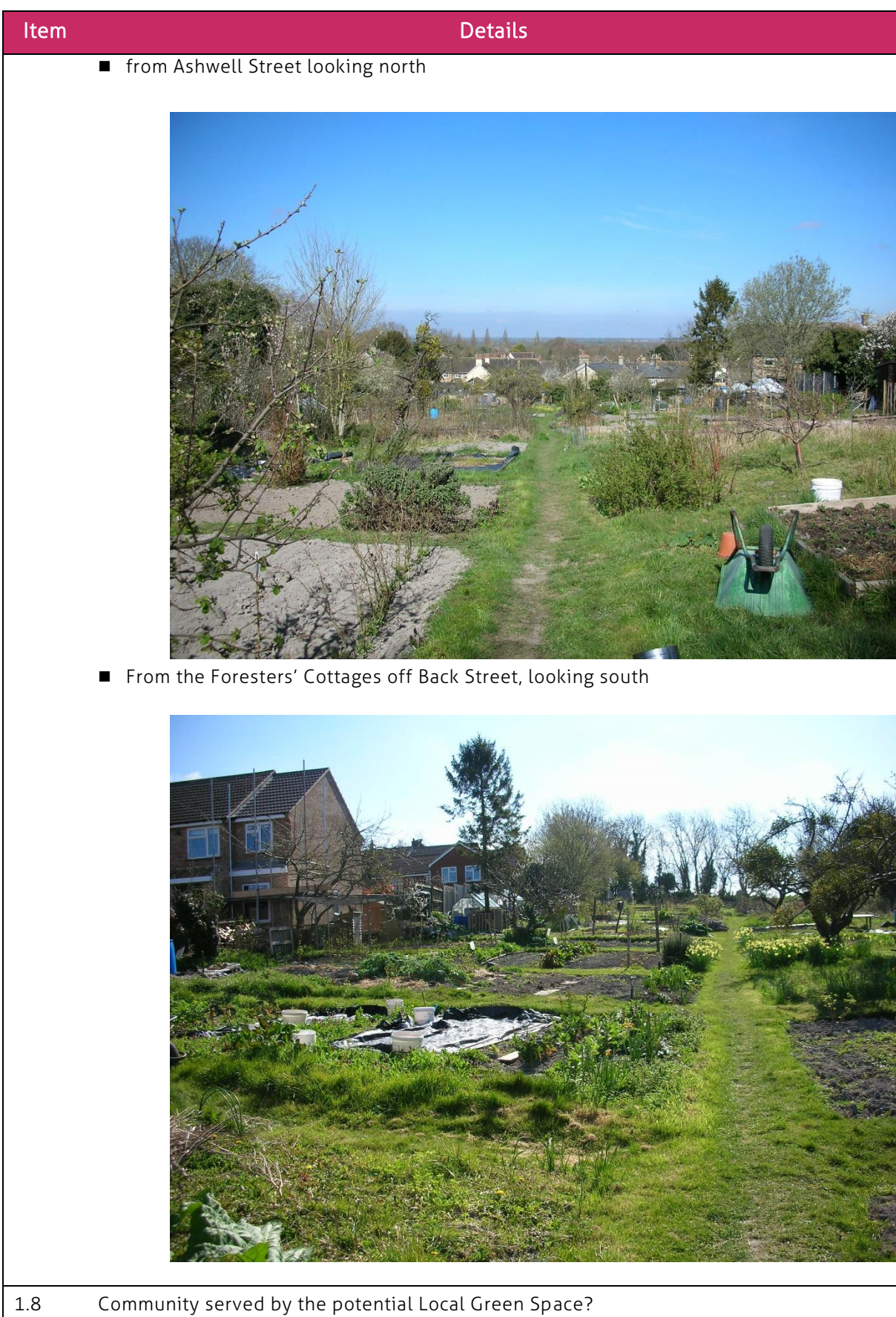
Community served by the potential Local Green Space?